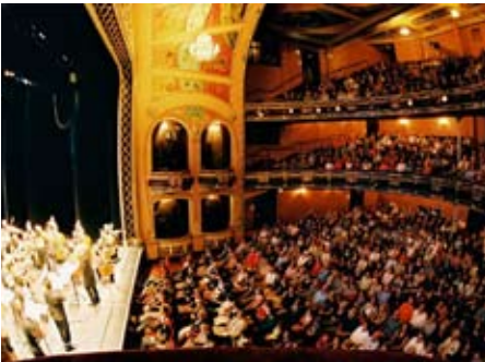
// HAWKE'S BAY OPERA HOUSE

In what is believed to be world-first research, TIA also carried out a stocktake exercise for the small tourist flight operators sector. Seven tourist flight operators took part, with a total of 48 aircraft. They included fixed wing planes, helicopters, float planes and ski planes from around the country. The results from the stocktake were shared with about 45 operators in the sector, to help them improve their overall environmental performance, fuel and energy efficiency.