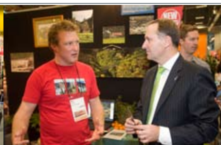
// DAN STEELE FROM BLUE DUCK LODGE WITH PRIME MINISTER JOHN KEY