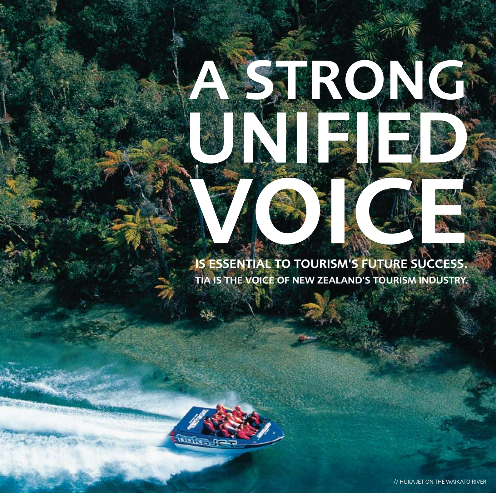
// HUKA JET ON THE WAIKATO RIVER

IS ESSENTIAL TO TOURISM'S FUTURE SUCCESS. TIA IS THE VOICE OF NEW ZEALAND'S TOURISM INDUSTRY.