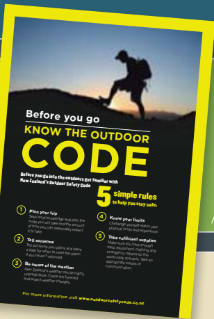
// OUTDOOR SAFETY CODE