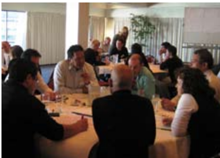
// TIA REGIONAL WORKSHOP