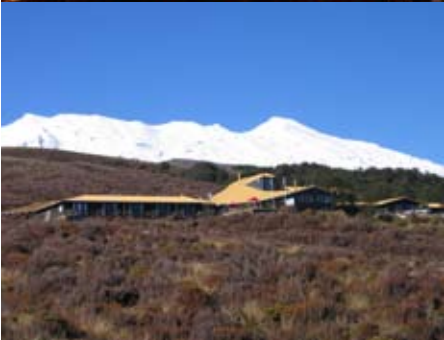
// SKOTEL ALPINE RESORT