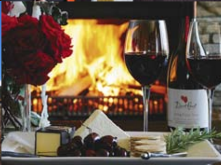
// LIME TREE LODGE