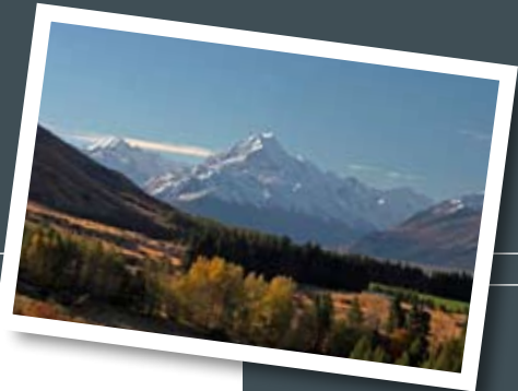
// MACKENZIE COUNTRY: PHOTO FROM DESTINATION MT COOK MACKENZIE