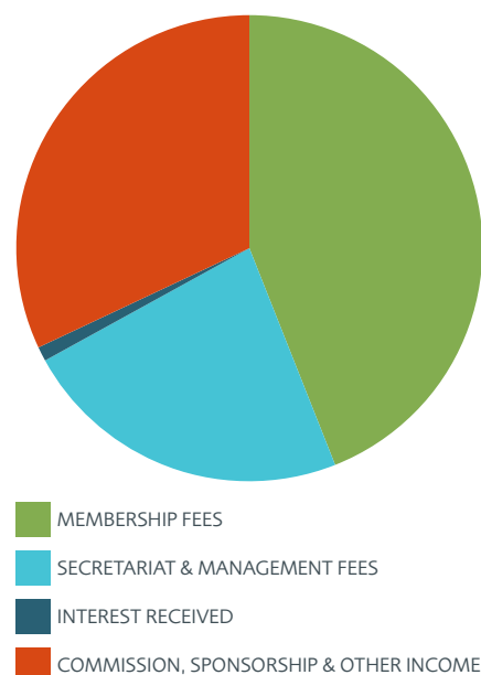
INCOME MIX 2009-10